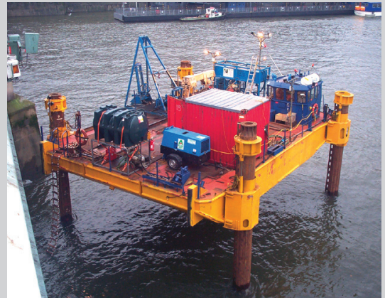
Marine Example: Intrusive survey from a jack-up barge on Westminster Bridge, London