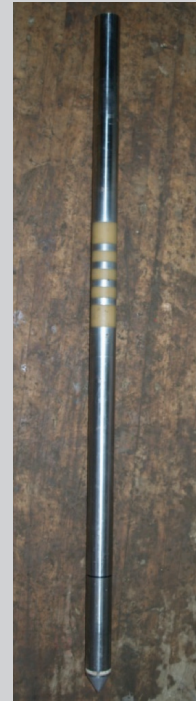
The SMC showing the standard Piezocone on the end and the 2 outer rings which measure resistivity and the two inner rings which measure the dielectric constant